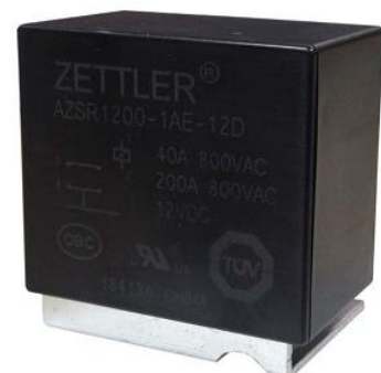
Figure 15: AZSR1200