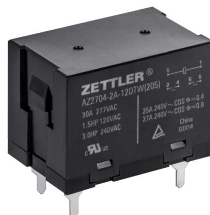
Figure 4: AZ2704

This 30 A DPST high power PCB relay is suitable for PV inverter applications of up to 6.6 kVA (single phase, 220V system) / 19.8 kVA (three phase, 380V system, 380V line voltage) and deployment levels of up to 7000 m (5000 m standard contact gap version) above sea level, in residential and smaller commercial / roof-top solar systems.