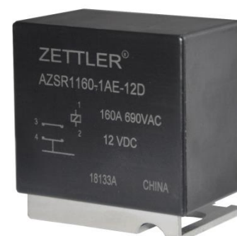
Figure 13: AZSR1160

This 160 A extreme high power PCB Relay has been designed for PV applications of up to 191 kVA (three phase, 690V system, 690V line voltage) – a highly attractive, small footprint substitute for conventional contactors. This relay is suitable for larger commercial PV systems and small commercial solar fields, deployable up to 7000 m above sea level and up to 8000m for 3.6mm gap option.