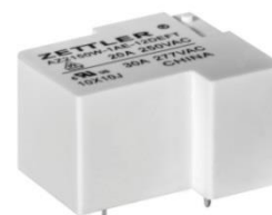
Figure 3: AZ2150W

This 30 A SPST high power PCB relay is a modified version of a reliable relay which is about more than 30 years in the market. With its standard pin layout it is suitable for PV inverter applications of up to 6.6 kVA (single phase, 220V system) / 19.8 kVA (three phase, 380V system, 380V line voltage) and deployment levels of up to 3000 m above sea level, in residential and smaller commercial / roof-top solar systems.