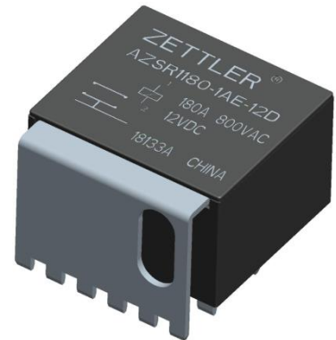
Figure 14: AZSR1180