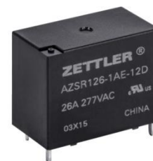
Figure 5: AZSR126

This highly efficient 31 A SPST miniature power relay has been on the market since about 10 years and features a wider contact gap of 1.8 mm . It is suitable for residential and small commercial / rooftop PV systems of up to 6.8 kVA (single phase, 220V system) / 20.4 kVA (three phase, 380V system, 380V line voltage) and deployment levels of up to 3000 m above sea level.