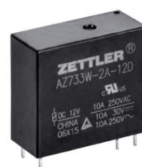
Figure 2: AZ733W

This 12 A DPST miniature PCB power relay has been marketed by ZETTLER for more than 20 years. It is suitable for residential PV inverters up to 2.6kVA (single phase, 220V system) and deployments at up to 2000 m above sea level. The relay features a standard pin layout and a relatively small footprint with a contact gap of 1.5 mm.