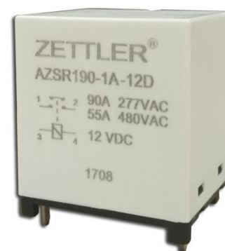
Figure 12: AZSR190

This 90 A standard version / 100 A "T"-version high power PCB relay will close the gap between AZSR165 and AZSR1160. Developed for PV applications of up to 59.4 kVA (90A) / 66 kVA (100A) (three phase, 380V system, 380V line voltage) this relay is well suited for medium sized to larger roof top based / commercial systems, deployable up to 8000 m above sea level.