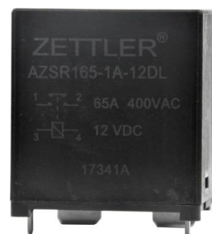
Figure 10: AZSR165

The AZSR165 is the 65 A economy version of the new AZSR190 series. Developed for PV applications of up to 42 kVA (three phase, 380V system, 380V line voltage) this relay is well suited for medium sized to larger roof top based / commercial systems, deployable up to 7000 m above sea level.