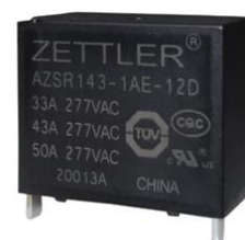
Figure 7: AZSR143

This highly efficient 50 A SPST miniature power relay is the result of consequent further development for the requirement to switch high loads in a small package. Remarkable is, that the power loss at the coil is only 1.6 W, which is only half as high as that of comparable relays on the market. It is suitable for larger residential and midsize commercial PV systems up to 33 kVA (three phase, 380V system, 380V line voltage) and deployment levels of up to 3000 m above sea level. The AZSR143 and AZSR131 are also suitable for many EV charging applications.