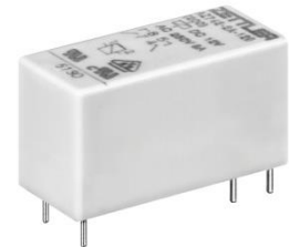
Figure 17: AZ742-2A-xxD(200)

As photovoltaic installations with transformerless solar inverters are not galvanically isolated, permanent measuring of the insulation is not possible when in operating mode, i.e. feeding energy into the grid. However, current safety standards for solar inverters and solar panels require that only systems with correct insulation can be grid - connected. Common switching components to connect the insulation measuring circuit with the inverter usually come in the form of relative expensive reed relays. ZETTLER's solution is a modified and very cost effective two-pole electromechanical relay meeting necessary standards.