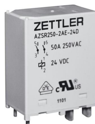
Figure 9: AZSR250