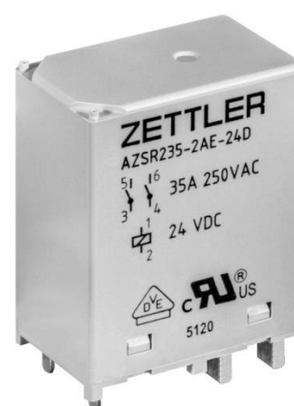
Figure 8: AZSR235

This 35 A DPST high power PCB relay is part of the first group of ZETTLER relays that were specifically developed for solar applications and has been deployed in many PV inverters since eight years. It is suitable for larger residential and small to medium commercial / rooftop PV systems up to 7.7 kVA (single phase, 220V system) / 23.1 kVA (three phase, 380V system, 380V line voltage), features a wide contact gap of > 2.05 mm making it suitable for deployment levels of up to 4000 m above sea level.