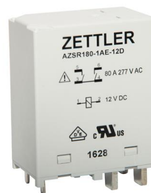
Figure 11: AZSR180

The 80 A high power PCB relay takes the AZSR235/250 series to the next logical level. Developed for PV applications of up to 52 kVA (three phase, 380V system, 380V line voltage) this relay is well suited for medium sized to larger roof top based / commercial systems, deployable up to 4000 m above sea level. It features a patent pending Thermal Bridge, designed to protect the parallel contacts from overheating as a result of uneven distribution of currents.