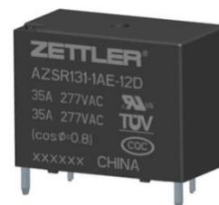
Figure 6: AZSR131

This highly efficient 35 A SPST miniature power relay is the result of consequent further development for higher requirements and features a wider contact gap of 2.3 mm . It is suitable for residential and small commercial / rooftop PV systems of up to 7.7 kVA (single phase, 220V system) / 23.1 kVA (three phase, 380V system, 380V line voltage) and deployment levels of up to 5000 m (3000 m standard contact gap version) above sea level.