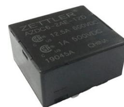
Figure 16: AZDC6

This 12.5 A DPST relay for switching DC loads up to 600 V is designed to fulfill all requirements according 2017 NEC 690.12 for rapid shutdown systems for solar panels. The compact size of 33.9 x 30.6 x 16 mm allows a flatter design of certain RSS (Rapid Shutdown System) boxes. The relay can also be used as a pre-charge relay in battery-powered systems. To effectively reduce inrush current peaks the pre-charge circuit is switched on before the system is completely started in order to charge the capacitors in the controller and converter using a current limiting resistor.